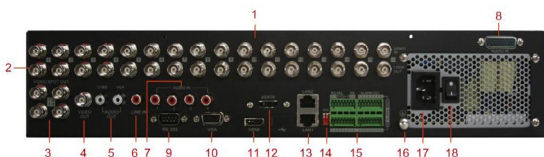
Rear Panel of DS-9116HFI-ST