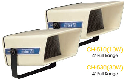
CH-510(10W) 4" Full Range